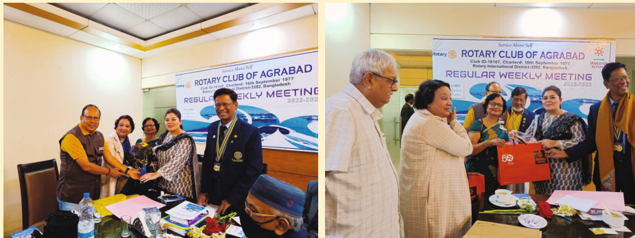
Acropolis members visit Rotary Club of Bangladesh