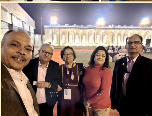
District Event Anandadhara celebrated with Grandeur