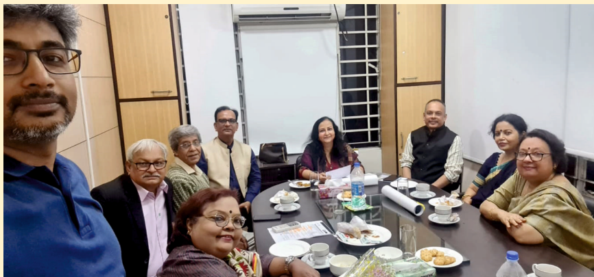
Asst. Governor's visit to Acropolis