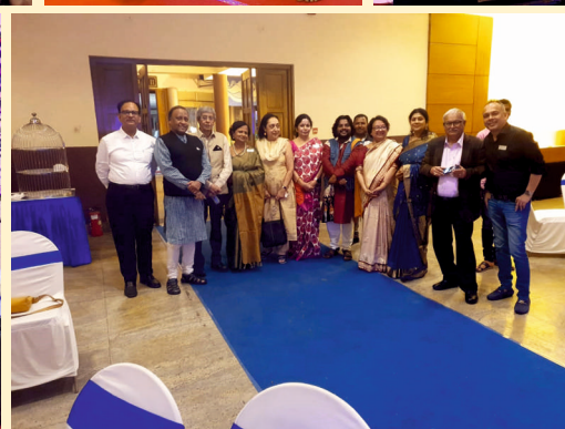
Team Acropolis celebrates Vijaya and Diwali Meet